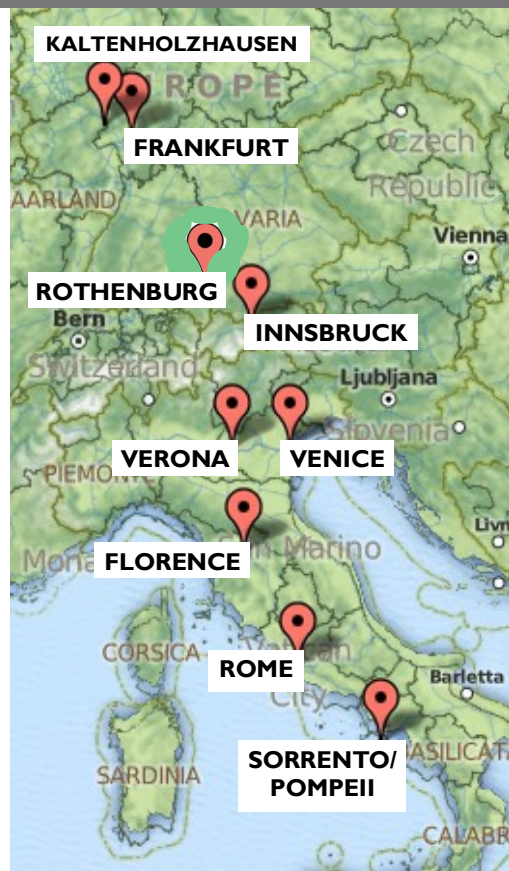
Above: Some of the featured stops on the tour