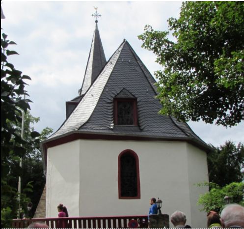
Above: The exterior of the Burgschwalbach church. Below: The interior of the church, picturing the stained glass windows, altar, crucifix, and symbolic paintings.